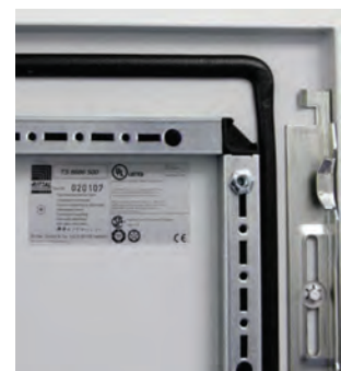
Four-Point Latching System and Continuous Foamed-In-Place Gasket

Padlock-able Handle Provides both easy access and security.